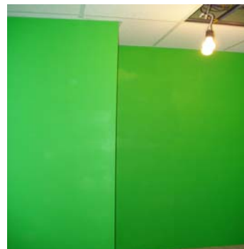
Green screen and stage area.